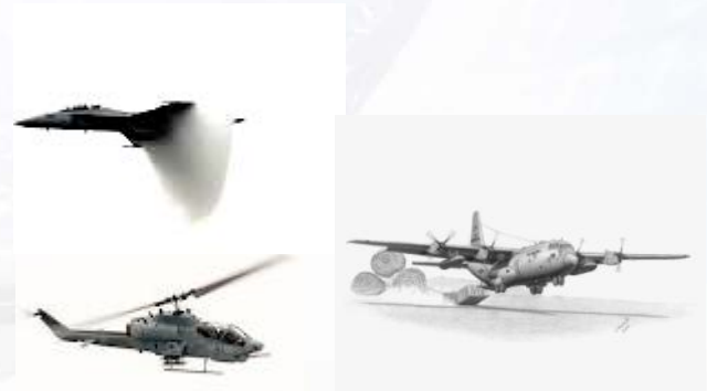
Improved tools for Flight Operations