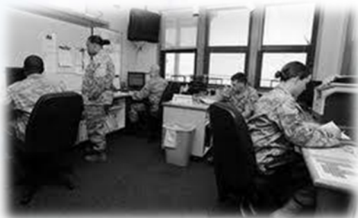
New Tool for creation and management

Partner with NGA and FAA on baseline data